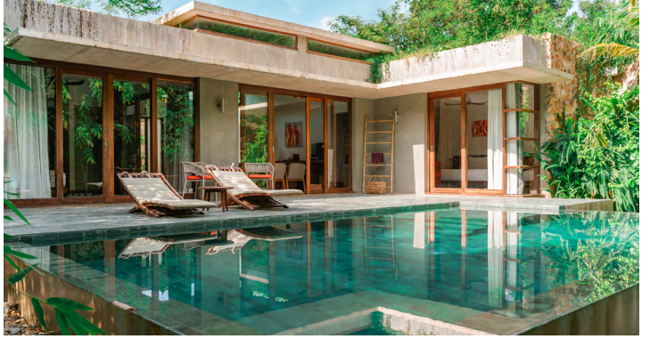
TWO-BEDROOM POOL VILLA (104 m 2 )*