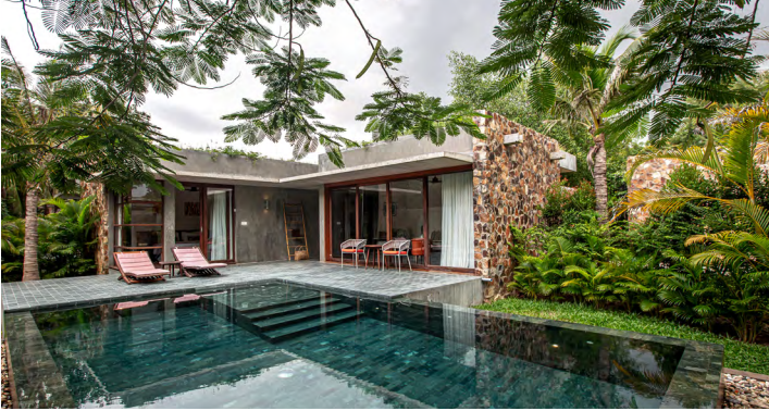
ONE-BEDROOM POOL VILLA (70 m 2 )*