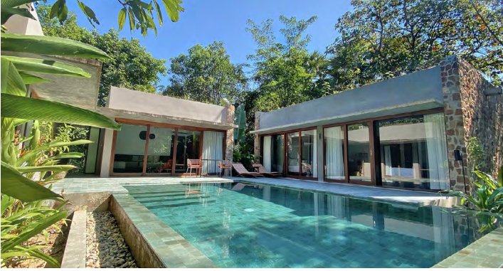
THREE-BEDROOM POOL VILLA (130 m 2 )*