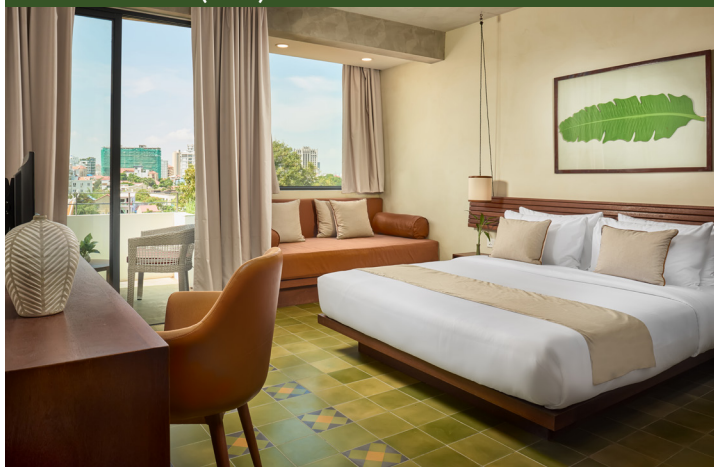
DELUXE DOUBLE (35m 2 )