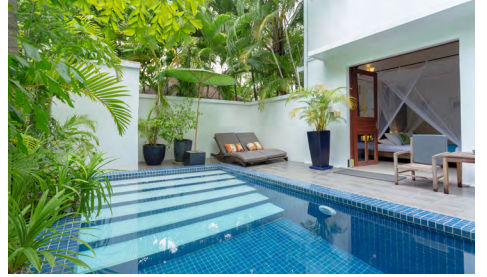
PRIVATE POOL ROOM (20 m 2 )*