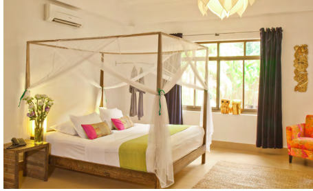
STUDIO (35 - 45 m 2 )*