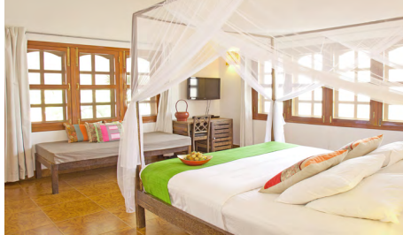
DELUXE DOUBLE ROOM (28 - 32 m 2 )*