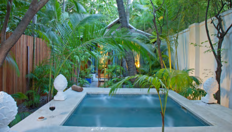
JACUZZI BUNGALOW (25 m 2 )*