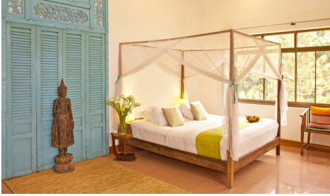
SUITE (60 - 65 m 2 )*