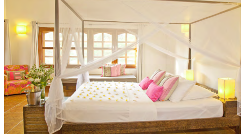
SUPERIOR DOUBLE ROOM (20 - 30 m 2 )*