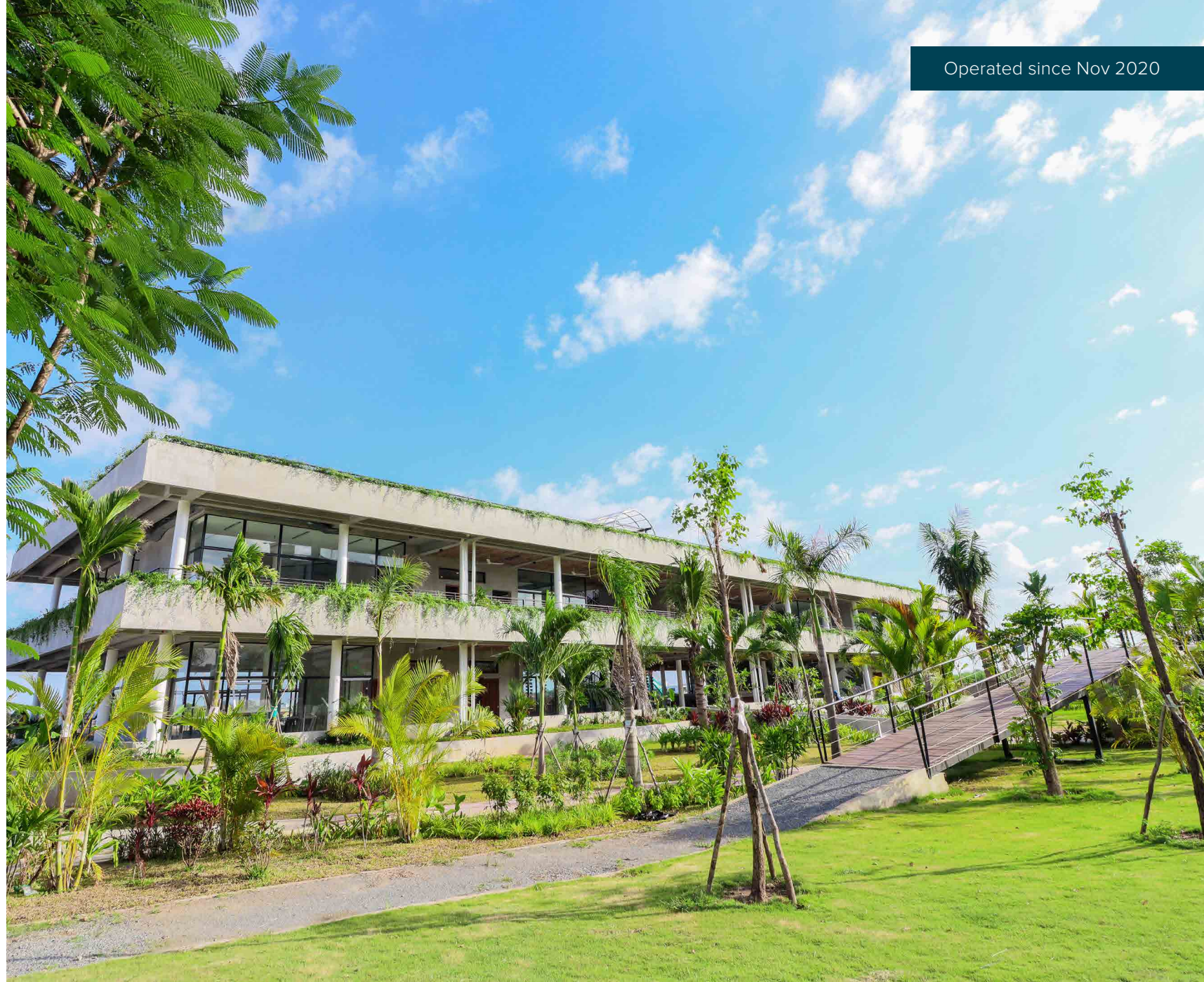
Coconut Club Building Exterior Coconut Park, Koh Pich, Phnom Penh

While the younger ones enjoy the many outdoor and indoor activities, leisurely dine and snack at the two restaurants overlooking the Bassac and Mekong Rivers, meet friends at the lounge bar, indulge in the beauty and health treatments at Jouvence Spa, take in some fresh air and stunning views from the top terrace.