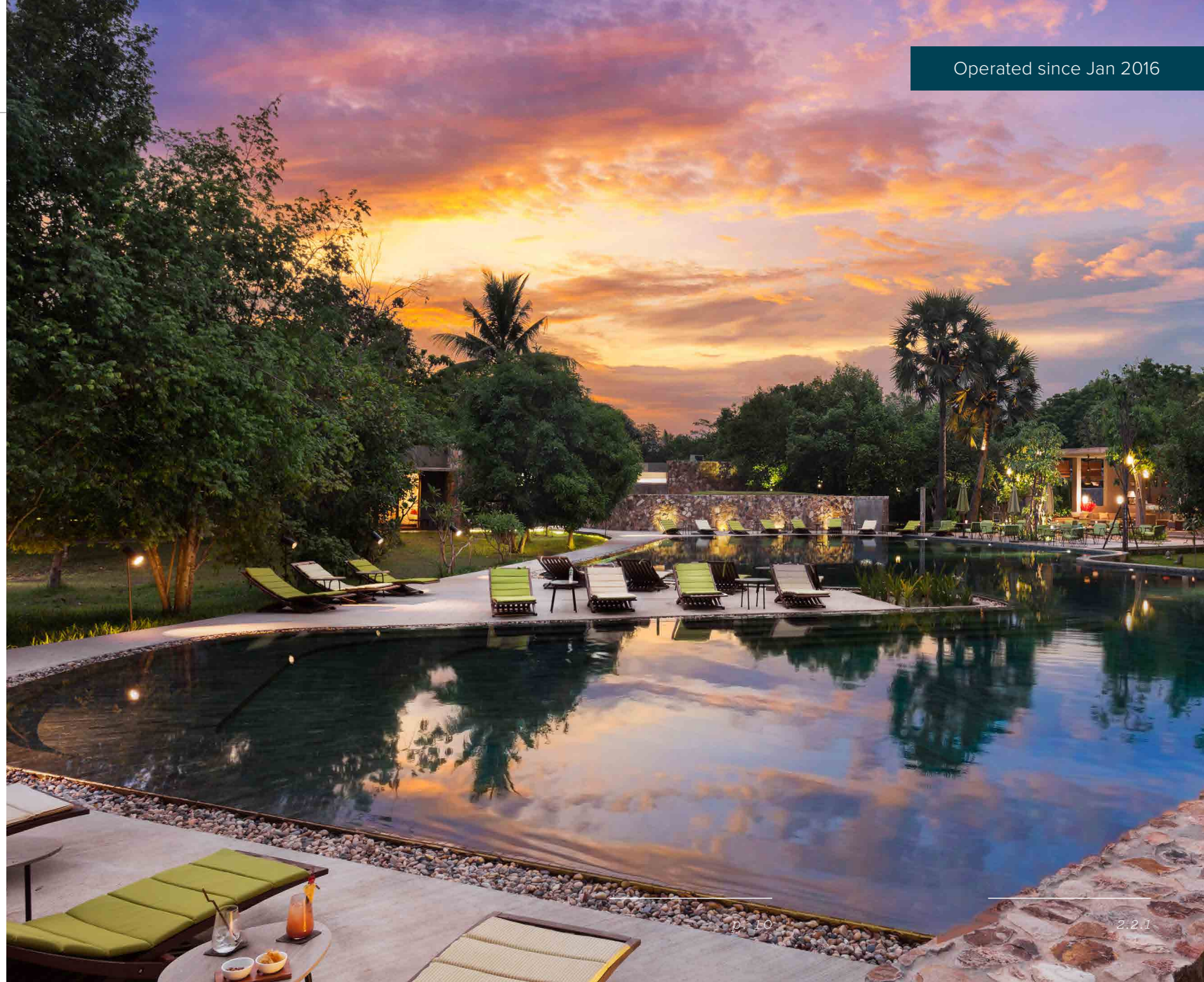
Main Pool Templation, Siem Reap

Rainwater is collected and a significant part of the power used is solar. The property has several Jungloos (our jungle igloos) as a glamping tented retreat.