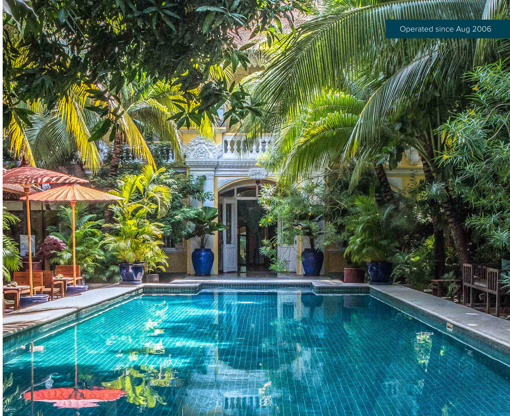
Lush Pool Pavilion, Phnom Penh

Some accommodations have their own private pool or jacuzzi, all boasting local art pieces from the owners' collection. Lush gardens, pools and ponds surround them, with all the atmosphere of the historical quarter.