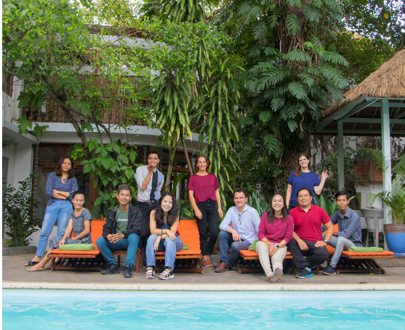
Maads Team Jungle Addition, Phnom Penh

A few more are presently under development and a sustained further expansion is foreseen. All projects have a consistent identity: strong character, great locations, interesting setups and lots of water and greenery. They aim to reflect a sense of harmony and serenity, respect architectural heritage and provide a personalized service. MAADS actively promotes regional culture and responsible tourism, and strives to always positively maximize guests' experience of its destinations whilst supporting the well-being of its teams.